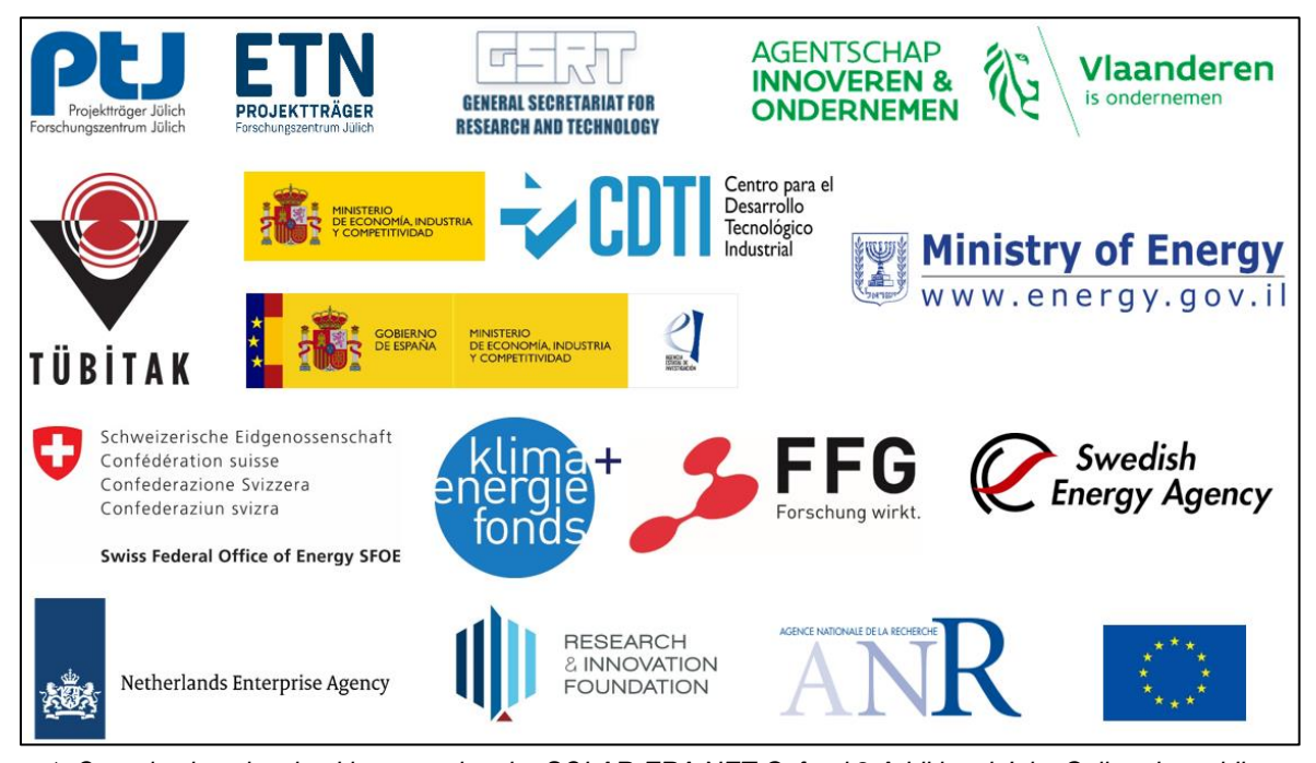
Figure 1: Organisations involved in promoting the SOLAR-ERA.NET Cofund 2 Additional Joint Call and providing support and funding to innovative transnational projects.

The participating national SOLAR-ERA.NET partners / contact points are listed in Table 1. Applicants are strongly encouraged to check the project idea and specific requirements with the national / regional contact point as early as possible in the preproposal phase.