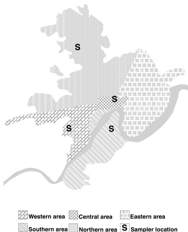
Fig. 1 Area of the four urban districts established for this study and location of the portable air samples.

Time spent in the district was also estimated: 41.6% of