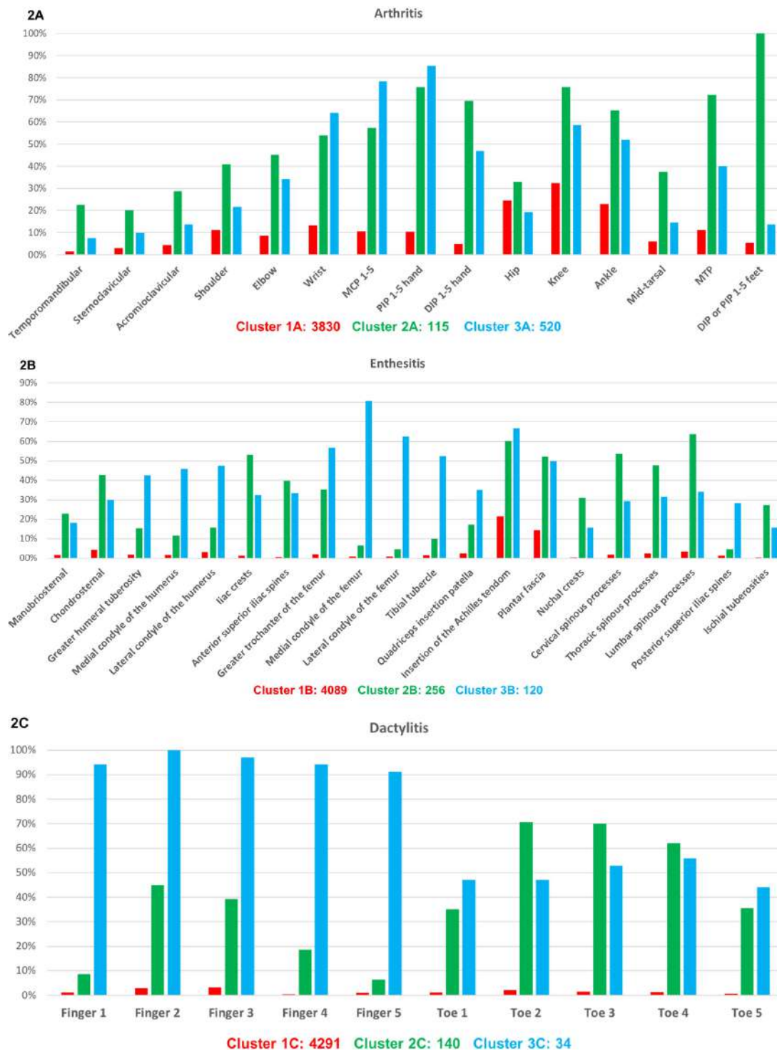
Figure 2 Distribution of the location of peripheral involvement across clusters with regard to the arthritis (A), enthesitis (B) and dactylitis (C). DIP, distal interphalangeal joint; PIP, proximal interphalangeal joint; MTP, metatarsophalangeal; MCP, metacarpophalangeal.

256 and 120 patients, respectively). Cluster 1B showed a very low prevalence of enthesitis (figure 2B) but, if present, they were more frequently located at the Achilles tendon and plantar fascia (ie, heel enthesitis). Clusters 2B and 3B showed a high prevalence of enthesitis, with a predominant involvement of axial locations in cluster 2B and peripheral locations in cluster 3B.